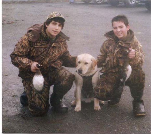
Nader Drake BJ

In Memory of Drake (Nader's dog) April 4, 2003 - May 14, 2014 Two Hunters Gone Too Soon, Hunting Together Now